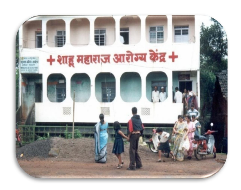
Free Medical treatment thru RSGVP

Provision of Ambulance on Medical Emergency for Villagers