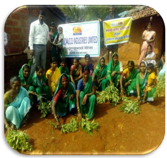
Swachha Bharath Abhiyan