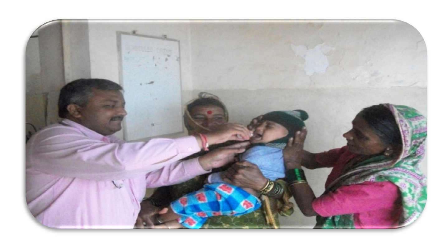
Campaigning eye check up, blood donation & pulse polio immunization programme at mine site.