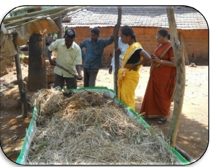
Training on Vermy Compost for SHG