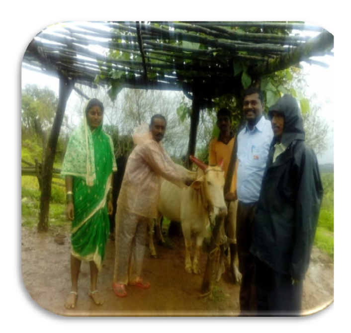
Cattle Vaccination thru Professional